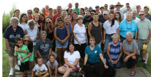
Juniors and advisors at the 2018 National Specialty.

The BMDCA has welcomed Junior members since the Club formed in 1968 and has enthusiastically supported Juniors over the years. Many of the adult faces we see in competition of all kinds, and as breeders and club leaders, are our Juniors of yesteryear.