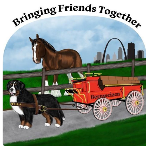
BMDCA National Specialty 2024

Entries limited to Bernese Mountain Dogs only