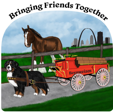
BMDCA National Specialty 2024

Registration & Catalog Sales at Ringside Health Clinics at Service Center International Guest Breakfast at Founders Room Futurity Obedience Versatility Showcase Veterans Sweepstakes Health Auction at Holiday Inn