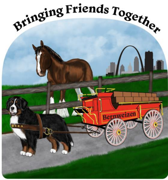
BMDCA National Specialty 2024