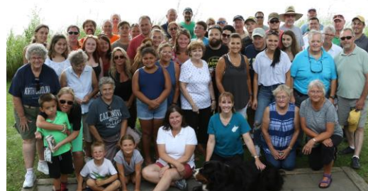
Juniors and advisors at the 2018 National Specialty.

The BMDCA has welcomed Junior members since the Club formed in 1968 and has enthusiastically supported Juniors over the years. Many of the adult faces we see in competition of all kinds, and as breeders and club leaders, are our Juniors of