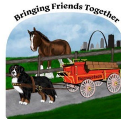
BMDCA National Specialty 2024